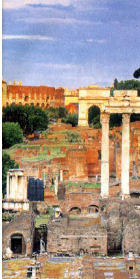
Left: the Forum. Below: the remains of a statue of Constantine II at the Capitoline Museum